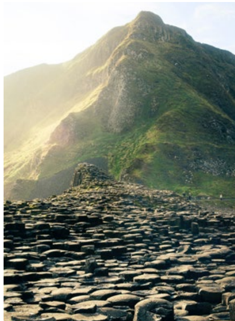
Clockwise L to R: Cobh, Co. Cork; Trinity College Dublin; International Financial Services Centre, Dublin; Giant's Causeway, Co. Antrim; Connemara, Co. Galway.