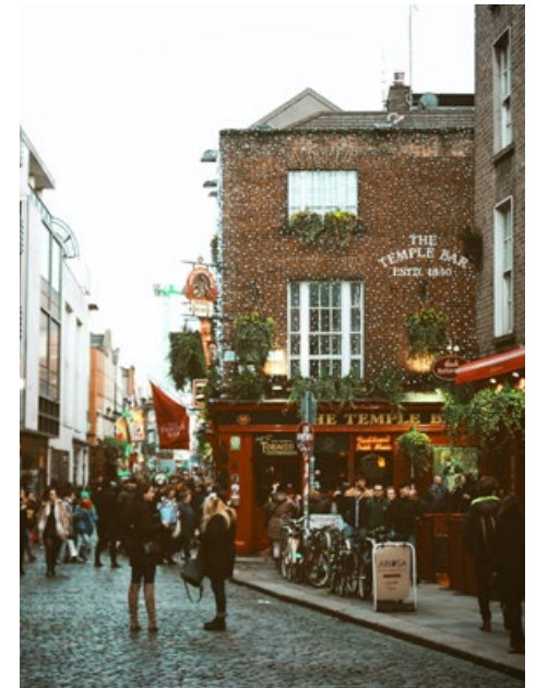
Clockwise, L to R: Cliffs of Moher, Co. Clare; Bunratty Castle, Co. Clare; National Gallery of Ireland, Dublin; Titanic Museum, Belfast; Temple Bar, Dublin.